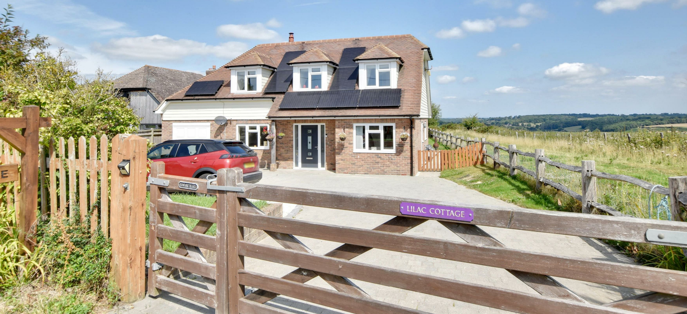
Lilac Cottage Udimore Road, Udimore, Rye, East Sussex TN31 6AY Guide Price £695,950